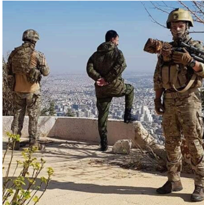
General Suheil al-Hassan overlooking Damascus from Mount Qasioun, March 2018. His security detail appears to be elite Russian troops 64 .

the Commander of the 4 th Armored Division 62 . Some sources interpreted Maher al-Assad's appointment as the regime's countermove to balance the Russian-backed rise of General al-Hassan 63 .