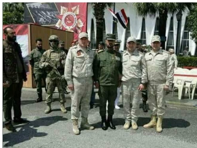
General Suheil al-Hassan during the Victory Parade at Hmeimim Base, May 2018, with his medal reported to be the 1 st Class Order of Suvorov 65 .