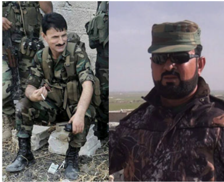
Suheil al-Hassan before (on the left, 2014) and after (right, 2016) the Russian intervention 57 .

The Tiger Forces are very well-equipped shock troops and combined arms unit that go beyond a battle-hardened paramilitary. Russia deliberately transferred very advanced weaponry, including Tochka tactical ballistic missiles, T-90 main battle tanks, and BM-30 Smerch heavy multiple launch rocket systems (MLRS) to General Suheil al-Hassan's offensive unit. Besides, al-Hassan is getting intensive close air-support from the Russian Aerospace Forces contingent in Syria 58 . While there are conflicting reports about the number of soldiers fighting for al-Hassan, it is estimated that he commands a core group of 4,000-strong elite fighters along with additional artillery and armored units, as well as on-call militia to support operations when needed 59 .