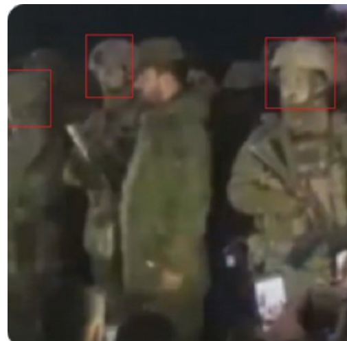
General Suheil al-Hassan in east Ghouta with his Russian security detail 78 .

Because of his shiny and swift rise, some experts think that al-Hassan became 'so powerful' that the regime might want to get rid of him. Such political eliminations took place in Syria before 75 . Notably, these speculations were voiced following the death of Major General Issam Zahreddine, a famous Druze figure at the ranks of the Republican Guard 76 . Tellingly, General Suheil al-Hassan was recently seen guarded by a Russian Special Forces security detail even when he was with the top generals of the regime 77 .