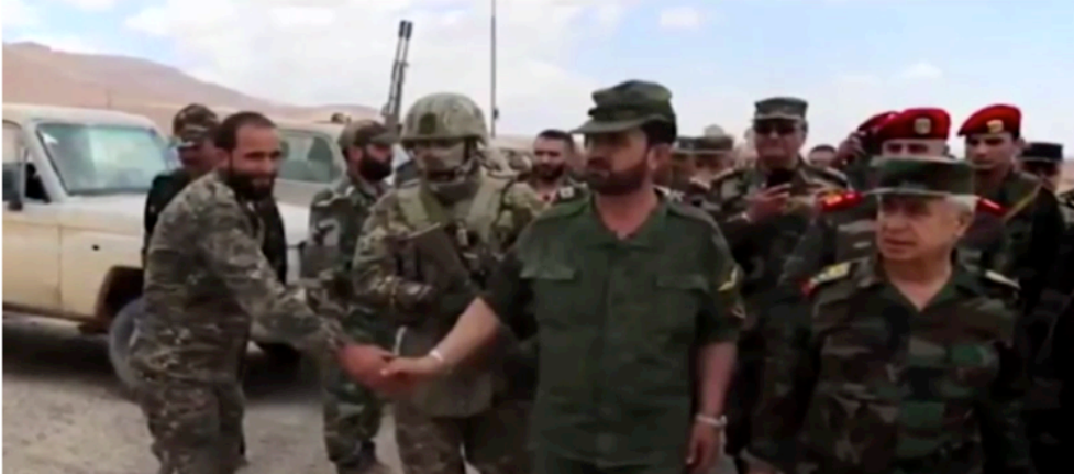
General Suheil al-Hassan with the Syrian Defense Minister Ali Abdullah Ayyoub during a visit to east Qalamoun. General al-Hassan, in fact a brigadier before his defense minister, shakes hand of the cheering soldiers, walks in line with General Ali Abdullah Ayyoub (something that a subordinate should never do). General al-Hassan's Russian security detail visible in the back (left, in mask) 74 .

Before his superiors, including the Minister of Defense General Ali Abdullah Ayyoub, the 'Nimr' acts like the commander-in-charge, rather than a subordinate 73 .