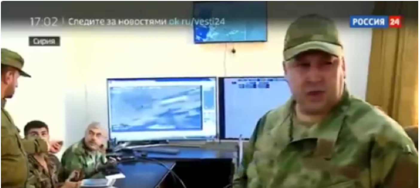
General Sergey Surovikin and General Suheil al-Hassan (standing in the back) in a command & control center in Syria 71 .

of the Russian contingent in Syria, General Sergey Surovikin (currently the Commander of the Russian Aerospace Forces, marking the first example since he comes from the Russian Ground Forces) in critical command & control centers.