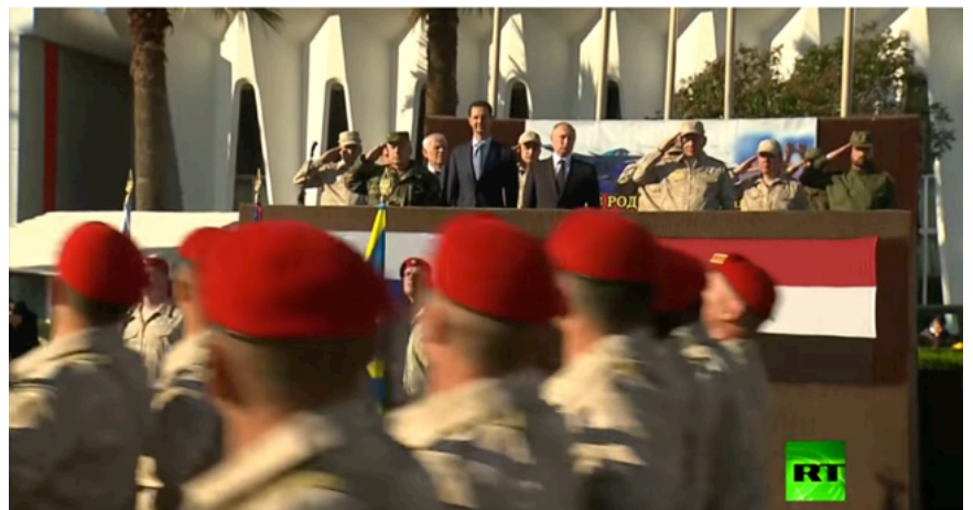
Russia Today broadcasting a parade at Hmeimim Base. General Suheil al-Hassan (right) saluting the Russian troops 70 .