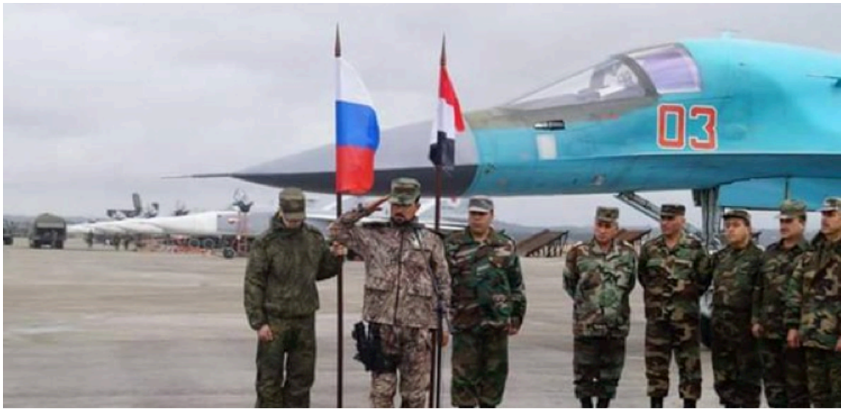
General Suheil al-Hassan in a medal award ceremony in the Russian Hmeimim Base, Latakia 18 .