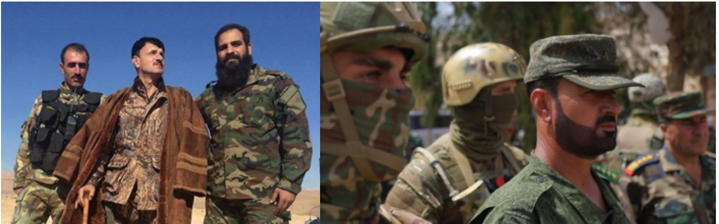
Suheil al-Hassan's transformation from an Alawite Air Force Intelligence colonel and 'war hero' into 'the general and cult military persona' protected by extraordinary measures 55 .

Yet, his first image had not reflected the present cult of military-persona. Below, two pictures of Suheil al-Hassan taken three years from one another can give an idea. On the left, there is a 2015 image released by a pro-regime news outlet. On the right, a 2018 picture with al-Hassan's Russian security detail visible in the back.