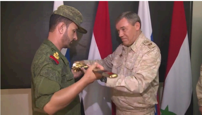
General Suheil al-Hassan was personally rewarded with an iconic sword by the Russian Chief of Staff, General Valery Gerasimov 69 .

Furthermore, during President Vladimir Putin's visit to Hmeimim Air Base in December 2017, Suheil al-Hassan appeared as the only Syrian military figure sitting at the table aside from Bashar al-Assad. There, Putin personally praised al-Hassan before his president 68 . In fact, this was something that can endanger a promising officer in a Baathist dictatorship. Moreover, inviting a brigadier-general of a combat unit to a presidential top-table itself is unusual in the military-diplomatic custom, especially considering the Syrian strategic cultural factors. All these signs are quite telling about General al-Hassan's future trajectory and the Kremlin's plans for him.